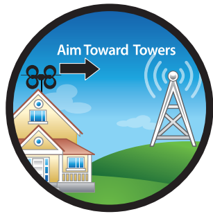
For Tower Locations: antennapoint.com