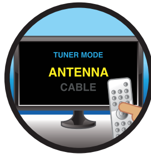
Input on Antenna Mode